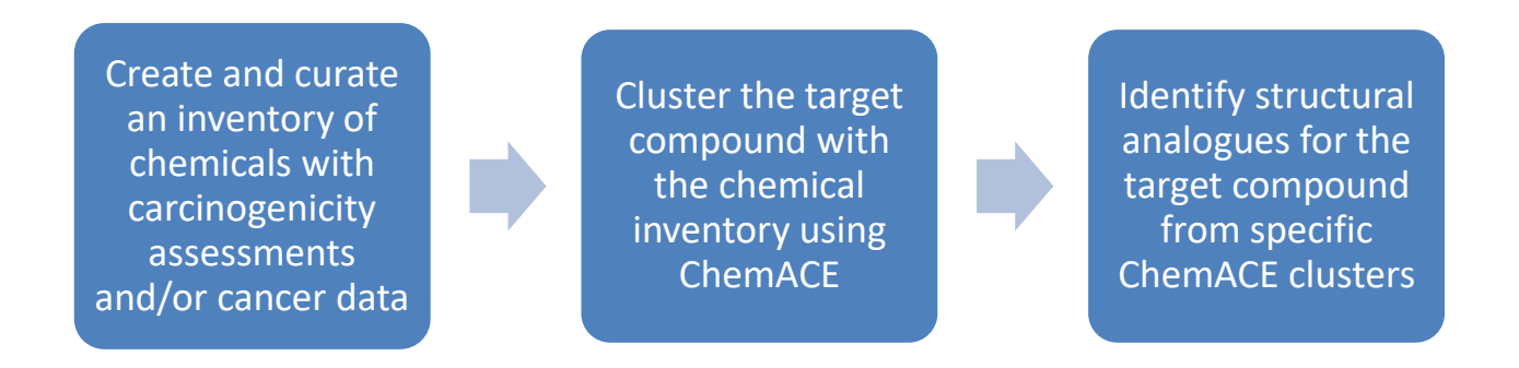
Figure B-2. Overview of ChemACE Process

For this project, ChemACE is used to identify potential structural analogues of the target compound that have available carcinogenicity assessments and/or carcinogenicity data. An overview of the ChemACE process in shown in Figure B-2.